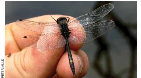
The dainty Dot-tailed Whiteface.