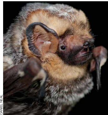
The Hoary Bat may travel from Canada as far south as the southern United States or Mexico.

its wings and performed a marvelous stoop that ultimately ended in success. He was indeed fuelling his own migration south. While hibernating bats live for an average of ten years, migration as we discovered takes its toll, and migrant bats can be expected to