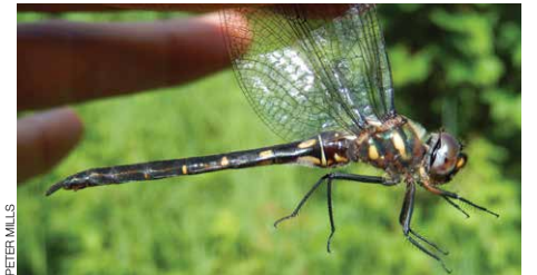
The elusive Forcinate Emerald.

This year’s Dragonfly and Damselfly Count was held on July 2nd. This citizen-science census was carried out by a large group of volunteers from all over southern Ontario, and achieved a tally of 67 species by day’s end—a tie for the highest ever. Some highlights included the discovery of a Dot-tailed Whiteface and Widow Skimmer, both of which are southern species that are very rare in the Algonquin highlands. A Forcinate Emerald was also netted, representing the fourth-ever park record and a reminder to us naturalists that surprises can happen anywhere and at any time, even in places we consider well-studied and understood!