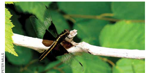
The Widow Skimmer prefers rich wetlands.