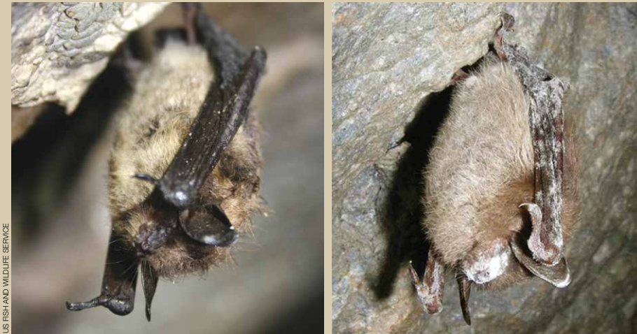
An example of a healthy Little Brown Bat, unaffected by White-nose Syndrome (left) and a hibernating Little Brown Bat suffering from White-nose Syndrome (right). Note the white fungus around the nose and on the wings.

Until recently the Little Brown Bat was the most common bat in Ontario. You may have seen them huddled under the stoop of your home or cottage or flying at night in an open area feeding on flying insects.