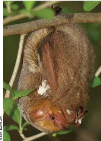
Migratory bats have elongated tail membranes that they fold over their bodies to conserve heat, as they hibernate singly and in more exposed areas than cave bats.

the only ones with our eyes on this bat. A Merlin, a small falcon, appeared and began harassing it. It fended off the threat, but as the Merlin left we noticed it was gaining altitude until it abruptly stalled in mid-air, folded up