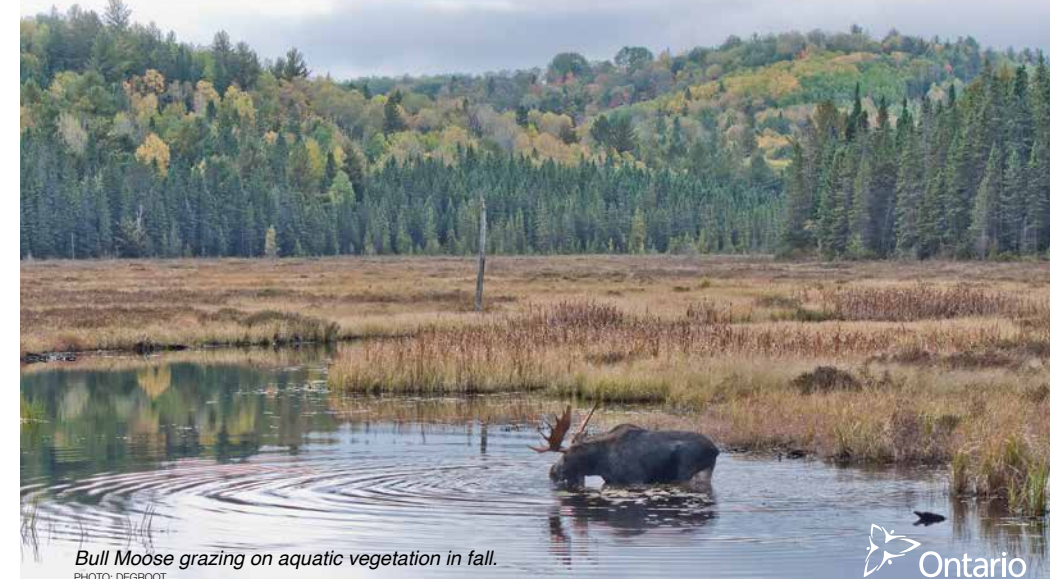
Bull Moose grazing on aquatic vegetation in fall.

When it comes to wildlife, most pieces of information are hard-won. Unlike humans, who would voluntarily participate in a survey or a census, animals will not share their information so freely. But why do we need to know anything about them in the first place? For starters, monitoring the health and overall number of animals in a population is important to know; is it declining, stable or increasing? How many males, females and juveniles are there, and what kind of reproductive success are they having? In some cases, where wildlife populations are hunted, having good estimates of their numbers is extremely valuable in determining how many