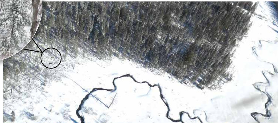
Even in winter, Moose can be hard to spot from the air. Note the size difference between the cow (below) and calf (above).