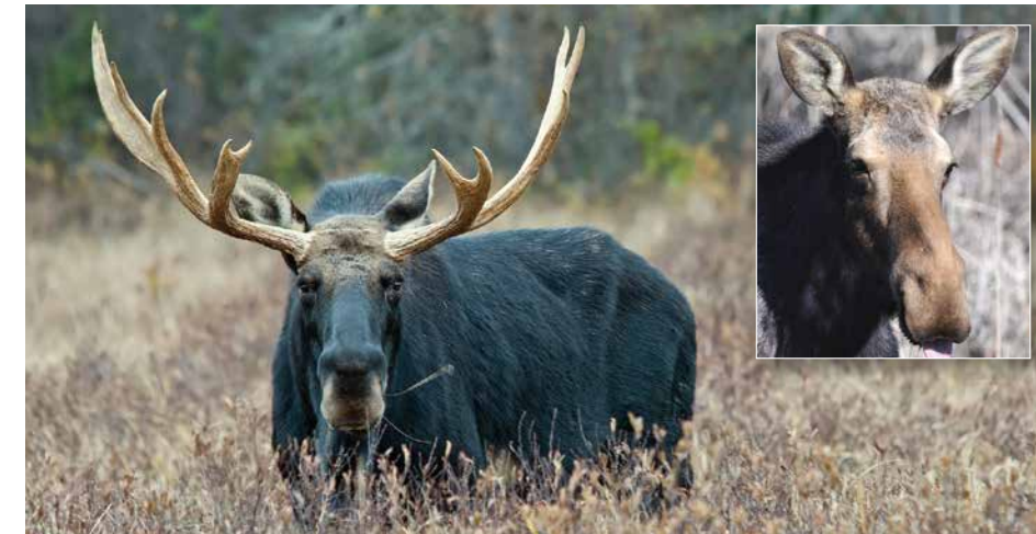
Differences in face colour can be useful in telling males from female Moose. Note the dark face (and antlers) of the bull versus the light face of the cow.

them. When deer are abundant, competition and disease usually prevent Moose from becoming abundant. By the 1960s, the Park had changed its ideas about wolves and no longer killed them. Wolves preyed extensively on deer, allowing Moose numbers to increase. Wolves do prey upon Moose, but show a preference for deer in Algonquin.