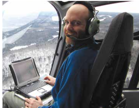
A Moose researcher recording data from the cockpit of a helicopter, high above the Algonquin landscape.

may be harvested sustainably. In other areas, where wildlife isn't hunted, these populations offer biologists a look at a more natural situation. Moose live in our vast Park which makes it difficult for us to get to most areas, and Moose can conceal themselves easily in the forest. So how can we get an answer to our question: How many Moose live in the Park?