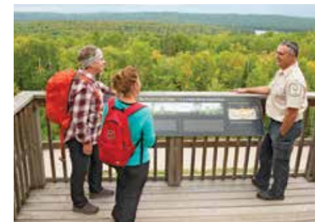
Park Warden talking to visitors at the Brent Crator lookout in Algonquin.