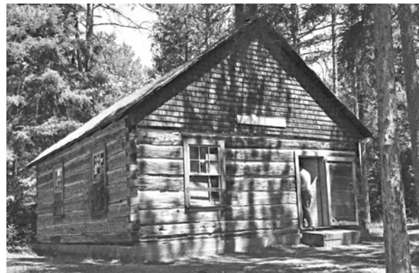
Kitty Lake ranger cabin, 1976.