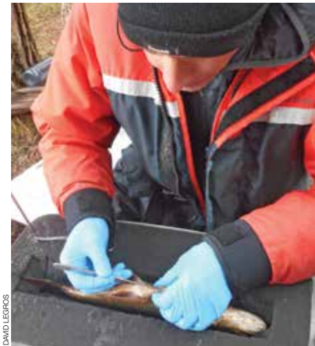
Fisheries researcher implanting transmitter.

In May 2017, fisheries researchers caught 20 Lake Trout and 10 Smallmouth Bass and surgically implanted them with acoustic transmitters. The transmitter (about the size of one AAA battery) emits a unique sound frequency every 5 to 10 minutes. The sound from the transmitter is picked up by acoustic receivers in the lake, which are installed one metre below the surface of the water.