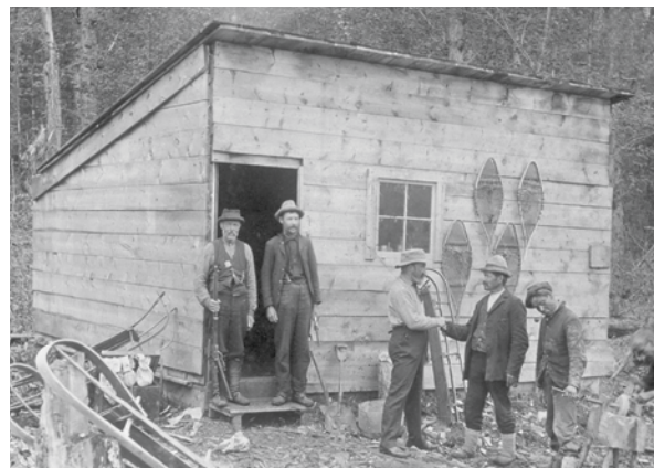
Ranger shelter hut at Rain Lake, 1897. These cabins (usually of log construction) were built at convenient day's travel distances along the ranger patrol routes.

Early spring or late fall canoe travel was as risky then as it is today, but even more so because, as there were no lightweight lifejackets then, none were worn. Mark Robinson told about rounding a point and