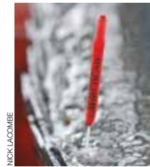
If you catch a fish with a red tag, please release it.

For more information see the bulletin boards or park office.