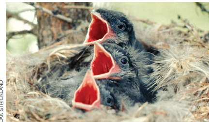
Canada Jay nestlings - 14 days old (above). Colour leg bands used to individually identify Canada Jays (below).

Researchers also recently completed their fall round-up, during which they counted Canada Jays along the Highway 60