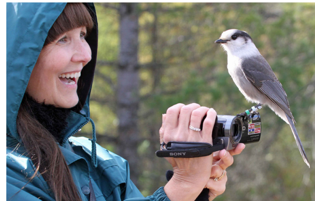
Canadians from coast to coast take great delight in meeting the confident Canada Jay!

The minutes from an AOU meeting a year later (1955) show that the committee clearly recognized that the decision not to have English subspecies names meant it would be "possible to retain as specific names a number that have been long in use". Consistent with this realization, in at least 18 cases the new species names proposed in the late 1940s were not used in the fifth official Checklist when it was eventually published in 1957. Instead, the original common names