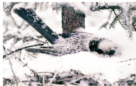
The ultimate Canadian bird? Canada Jays nest in late winter well before snowmelt.

with "Canada" in its official name. More to the point, people started to ask me why the name had been changed in the first place and I had to admit that I really had no idea.